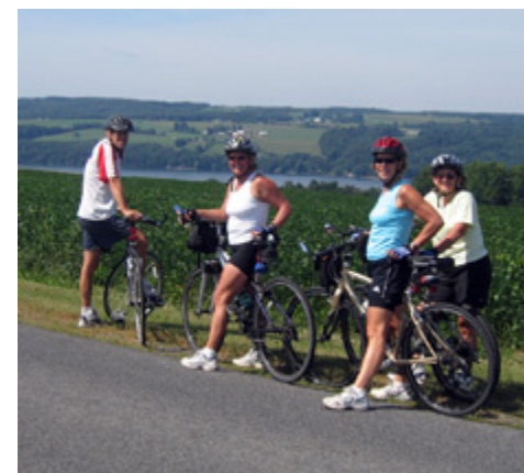
Blog about your experience here